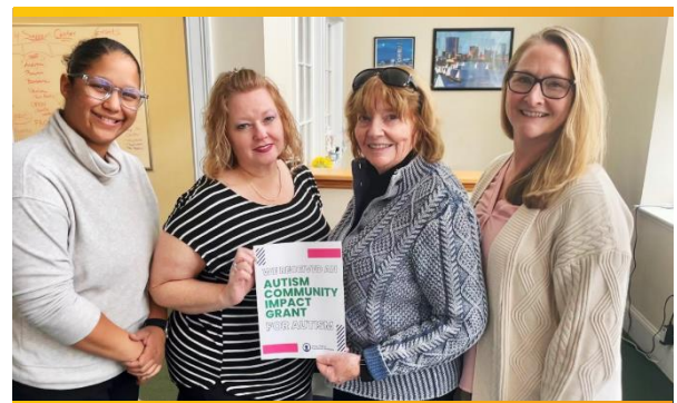
Family Support Center Team