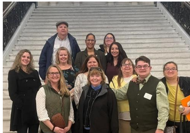
The Peer Support Group and The Arc Staff